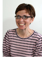
PRESIDENT-ELECT CARRIE AKINS Calvert County Public Schools